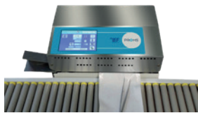
TS 46T with Roll Conveyor option