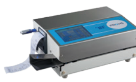
TS 46T with USB option